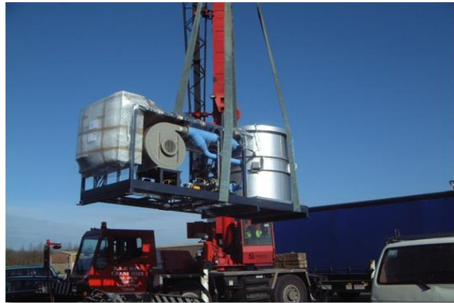
Figure 1: TORBED T1000 Module being installed

The TORBED Reactor, burner system, process air and control systems are skid mounted for ease of transportation and installation. The TORBED and ancillary equipment will automatically operate for extended periods with the minimum of operator attendance.